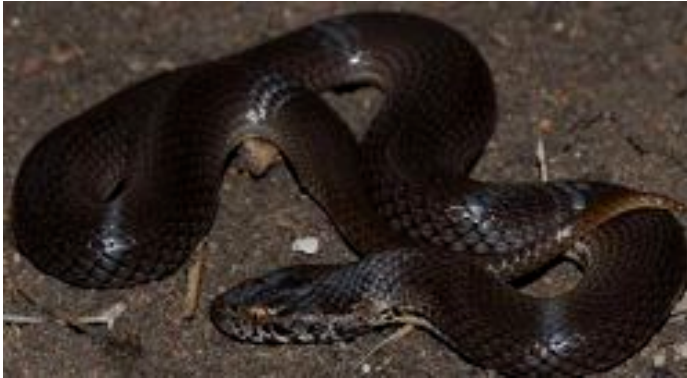
Ornamental snake - vulnerable