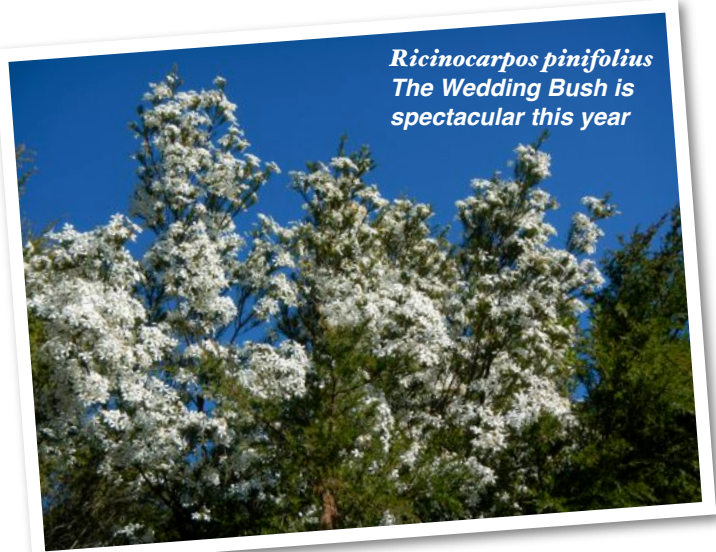
Ricinocarpos pinifolius The Wedding Bush is spectacular this year

BIEPA has come a long way on this issue and it must be noted that it is not just the responsibility of council to take action but rather the community. So BIEPA needs your support to shout and shout louder to our government representatives.....it's time the region had a policy to save our delicate and unique ecosystem and ultimately our lifestyle.